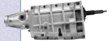
Richmond Street Five Speed

The Richmond Street Five Speed transmission delivers the ultimate blend of performance and economy. Utilization of four extra low gear ratios provide dramatic improvements in acceleration, while a 1:1 fifth gear allows maintenance of original fuel economy.