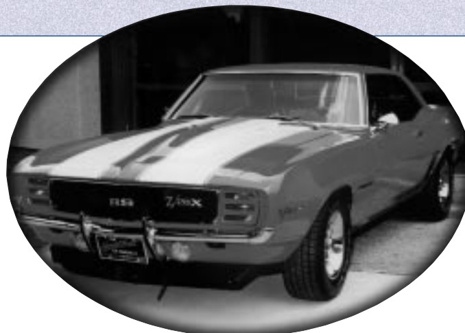
Richmond Two Speed