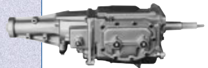
Richmond Super T-10 Plus Four Speed

Designed for the rigors of a road course, the Richmond T-10 Plus is built in the U.S.A. by American Craftsmen. Using the latest CNC machining and in house treat, this T-10 is available in a multiple range of ratios. The T-10 Plus combines race proven synchro assemblies and NASCAR proven technology to deliver smoothness and strength needed for the demands of a road course. Engineered with a pro-quality approach, the Richmond T-10 Plus delivers the quality and performance you expect!