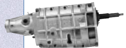
Richmond Five Speed Road Race

The Richmond Road Race Five Speed transmission is designed for the specific requirements of the road racer. The five speed transmission is made in the U.S.A. by American Craftsmen using the latest CNC machining and in house heat treat. This transmission features NASCAR proven road race style brass and a steel billet front bearing retainer for strength. Available in a wide variety of ratios, this transmission has tremendous torque multiplication and easy serviceability. Fully synchronized for smooth shifting, this five speed meets the challenge of demanding shifting of the road racer!