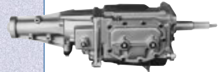
Richmond Super T-10 Four Speed

The Richmond Super T-10 is a four speed countershaft helical gear transmission synchronized in all forward gears. First and reverse are constant mesh to prevent gear clash. Strut-type synchronizers are provided for longer life and easier shifting. The T-10 is used in applications for performance type automobiles and light trucks. The Richmond Super T-10 is the NASCAR standard.